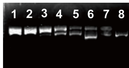
Figure 2. DNA damage protective effect of ethanol extract of M. calabura fruit. Lane 1: plasmid pBR322 treated with Fenton reagent; Lane 2-6: plasmid pBR322 treated with Fenton reagent and extract in increasing concentrations. Lane 7: the native plasmid pBR3G322. Concentrations of the extract (lane 2 to 6) from 0,01; 0,04; 0,16; 0,65 and 10,46 mg/mL, respectively.

The extract of M. calabura fruit was investigated for its antibacterial activities against gram positive ( S. aureus , S. epidermidis , and S. mutans ) and gram negative ( C. violaceum and E. coli ) bacteria, which were selected based on their relevance to human pathogens. As seen on Table 3, the fruit extract exhibited considerable antibacterial activity against the tested bacteria. The experiments revealed that C. violaceum was the most sensitive as can be seen from the lowest MIC and MBC values. Whereas, the lowest activity was observed against S. epidermidis and E. coli .