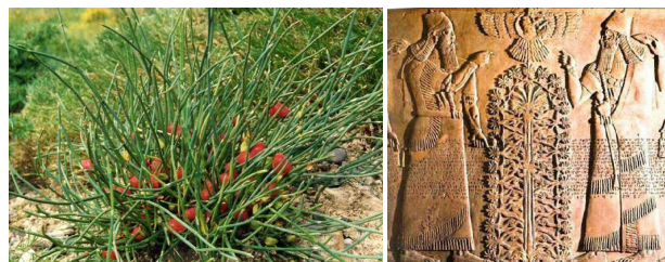
Figure 1. The holy plant called Haoma or Ephedra ( Ephedra major host) in Zoroastrianism.

The results of Iranian historical studies have shown that the history of the use of medicinal herbs in Iran dates back to the time of Aryan civilization from about 6500 to 7000 BC when Zarathustra referred to the properties of medicinal plants in his writings. In Zoroastrianism in Iran, a plant called Haoma or Ephedra ( Ephedra major host) was considered a sacred plant (Figure 1) (17). In Iran, the traditional science of medicine and pharmacy is the result of the integration of nation's prehistorical beliefs and traditions of the early inhabitants of Mesopotamia and then the Babylonians, Assyrians, Elamites and other ancient civilizations (19,20). Iranians have long enjoyed advanced knowledge about medicinal plants and their properties. The most prominent example of this argument is Avesta , the sacred book of Zoroastrianism. Many sections of Dorandiyud , one of the 5 books of the Avesta ,